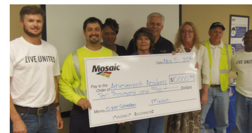
Mosaic in Bartow donated $10,000 to Achievement Academy for their 10th Anniversary Celebration. Thank you Mosaic!