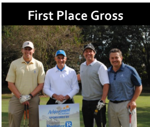
Team Jenkins Motorsports

At the end of the day, over $42,000 was raised, thanks to all our sponsors, participants and volunteers. A special Thank You to our Presenting Sponsor, Day & Night Tire and J. Burns Pizza ; and to our Participating Sponsor, GEICO . We appreciate you!