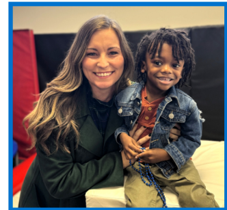
McKenzie Richardson Tinsley Creative