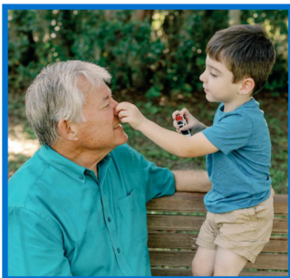
Dennis Ross Former U.S. Congressman