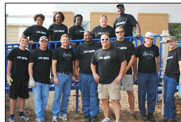
Day of Caring volunteers from Publix

The Lakeland campus got a fresh new look for its two playgrounds thanks to the hardworking volunteers from Publix. The thirteen volunteers from the Publix Dairy Plant—Bldg 18 came out on October 20th and spread mulch, trimmed trees and cleaned equipment for the playgrounds in Lakeland which includes the playground for our new classroom. The children and staff certainly enjoyed playing on the transformed playground and finding the “surprise” sandcastle left by the volunteers. This kind act was a United Way Day of Caring opportunity which allows companies to partner with community agencies by providing a service.