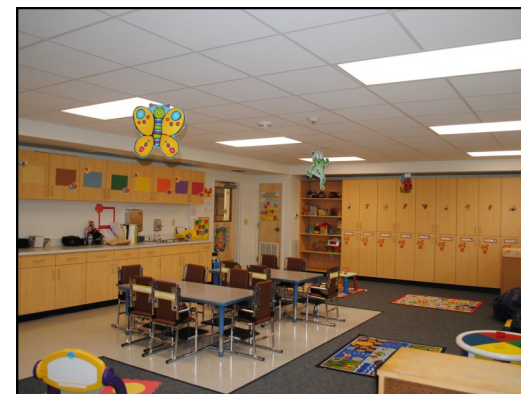
One of our New Classrooms

the funds necessary to complete our project, Rodda Construction began demolition in May 2013. We were able to add five new classrooms as well as three new therapy rooms for speech, occupational and physical therapy. Because of the expansion we were able to significantly reduce the number of children on our waiting list. Parents were delighted to receive the phone call over the summer offering their child an opportunity to participate in a program that gives them specialized instruction by a certified teacher along with weekly individualized therapy sessions at no charge. We enthusiastically opened doors on August 19, 2013 for all of our new and returning students.