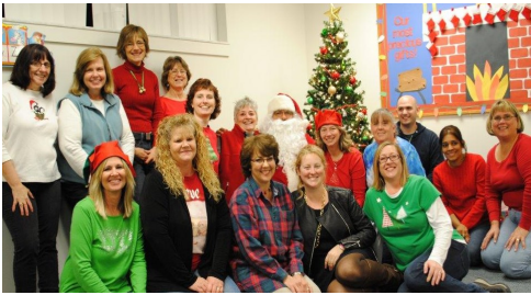
Santa and his Achievement Academy helpers.

Achievement Academy held its annual holiday party at the Lakeland Campus on December 9th. Students and families enjoyed lots of different activities such as making snowmen out of marshmallows, designing jingle-bell bracelets, making reindeer food, and a "music and movement" activity under the twinkle of holiday lights. A special appearance by the man himself - Santa Claus - was by far the highlight of the evening! Thank you to all who came out for a night of fun and merry-making.