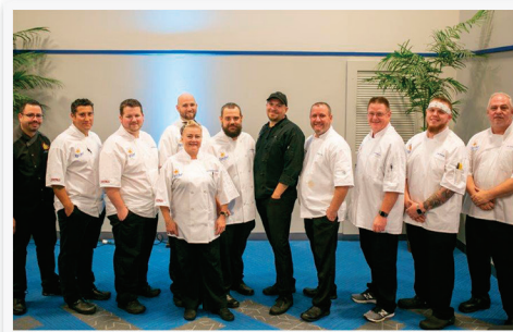
A special thank you to our wonderful chefs. You were all amazing!